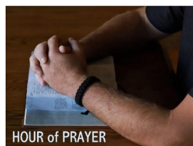
HOUR of PRAYER

Hour of Prayer - Come gather in the Narthex, grab a hot beverage from our new coffee maker, and share prayer requests! We will pray over existing prayer requests of Kirkwood and those mentioned in person. We will meet on Tuesdays from 7-8:30 p.m. in the Narthex.