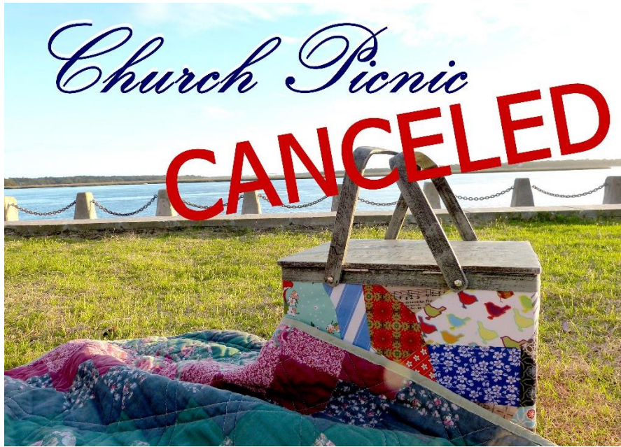
Due to the pandemic, the church picnic has been canceled.